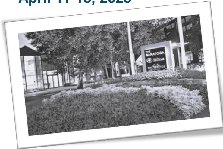
@Saratoga Hilton Hotel